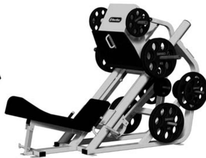
INCLINE LEG PRESS