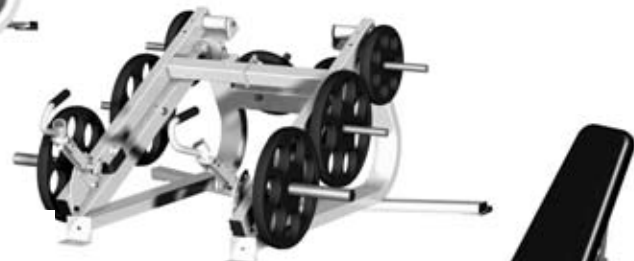
DEAD LIFT / SHRUG