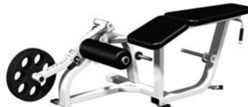
LEG CURL PRONE