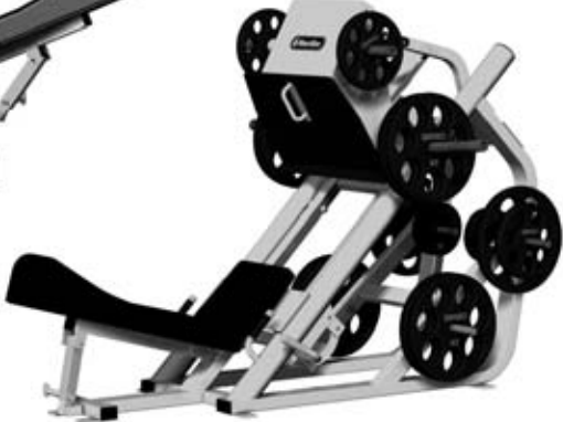
INCLINE LEG PRESS