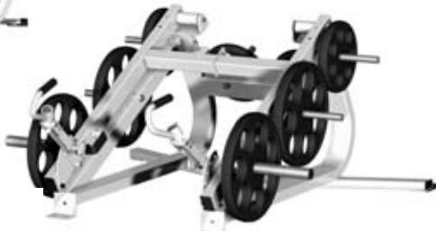
DEAD LIFT / SHRUG