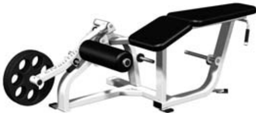
LEG CURL PRONE