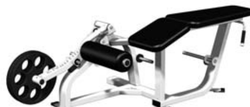
LEG CURL PRONE