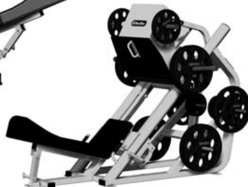
INCLINE LEG PRESS